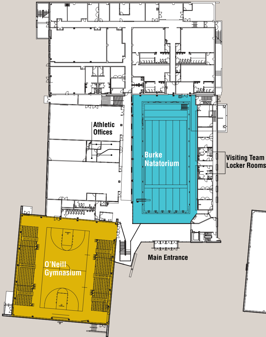
Dixon Athletic Center 1st Level